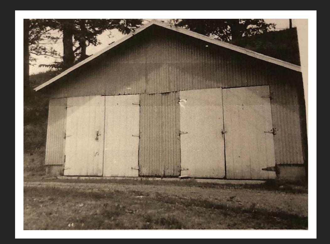
Overview of garage assigned to Scientific Assistant's Cottage in 1941, facing north-northwest.