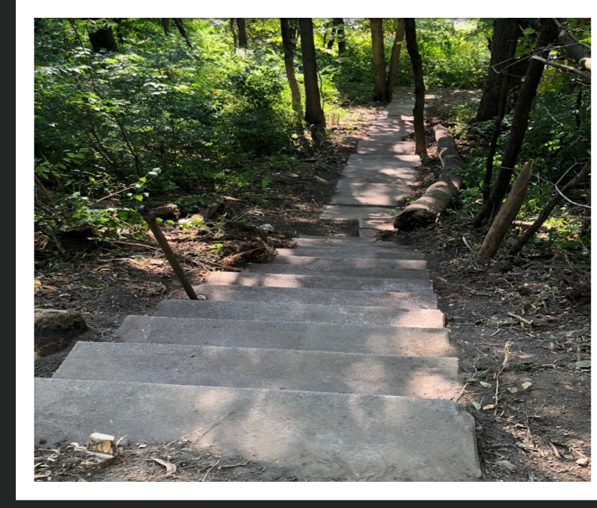
View of steps from cottage to the Lower Road in 2021, facing south.